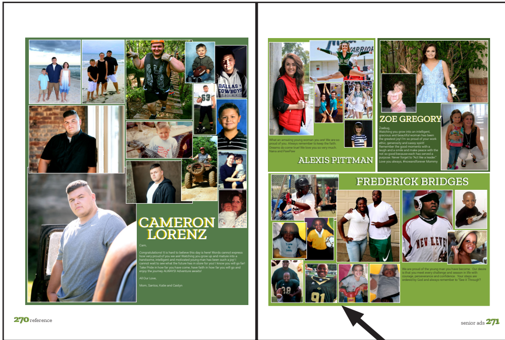
Sample from 2019 Yearbook