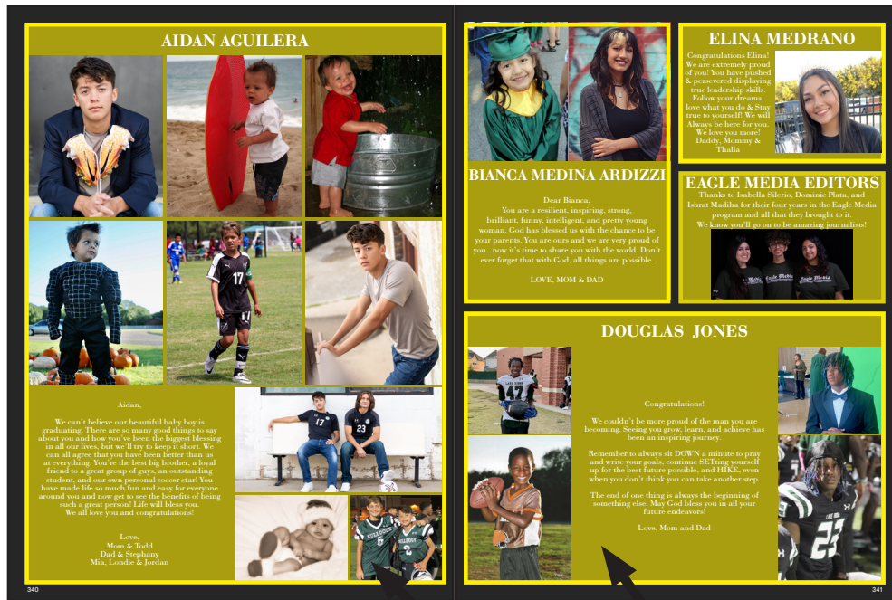
Sample from 2024 Yearbook