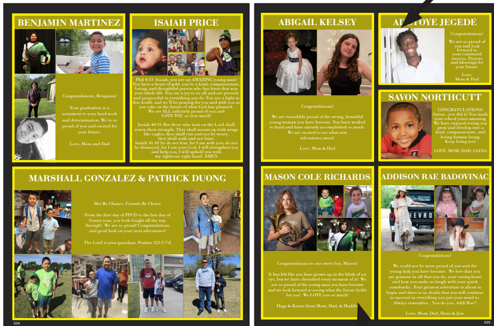
Sample from 2024 Yearbook